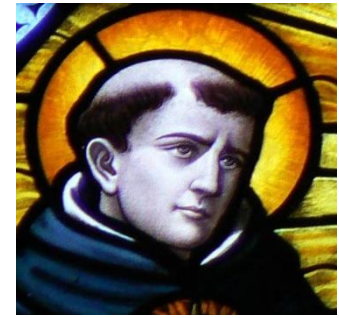
St. Thomas Aquinas