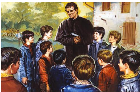
St. John Bosco

The rules established by Aquinas Academy concerning student behavior are intended to aid the student in developing a respect for him/herself, his/her fellow students and the entire community. Hopefully, this will be achieved through a mature self-discipline in which the student will learn to make choices which will be beneficial to him/herself and others and to accept the effects and consequences of these choices.